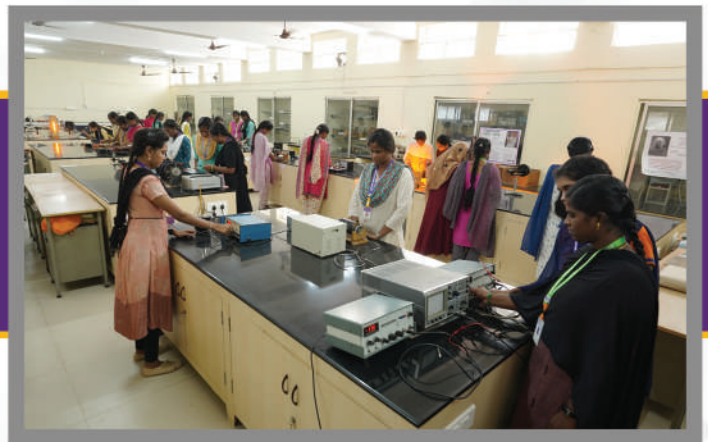
LIFE SCIENCE LAB